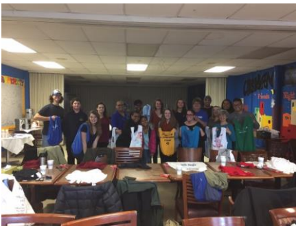
MLK Day of Service