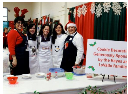
Christmas Cookie Decorating