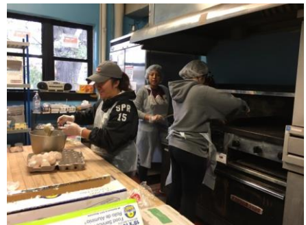
Alpha Phi Omega