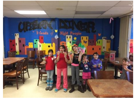
Junior League Little Leaguers