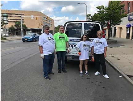
United Way Day of Caring

A heartfelt thank you to all of our volunteers and donors who support us!