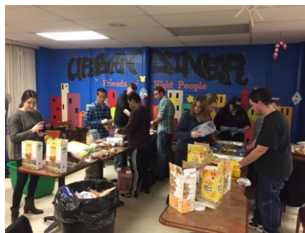
B-Team of Buffalo