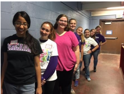
Diocese of Buffalo Give Back