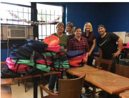
Back2School Backpack Prep